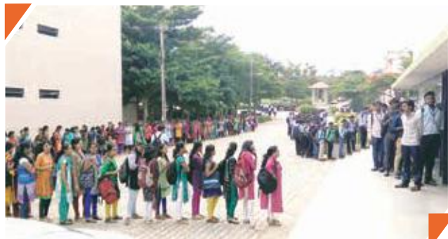
Pooled Drive Fujitsu - 24th May 2016