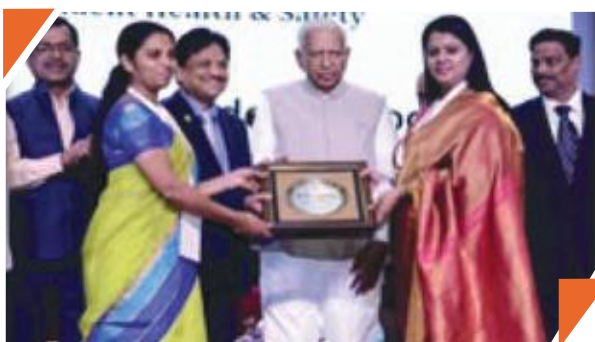
ASSOCHAM Best School Innovation Awards 2017 - Innovation in School Health