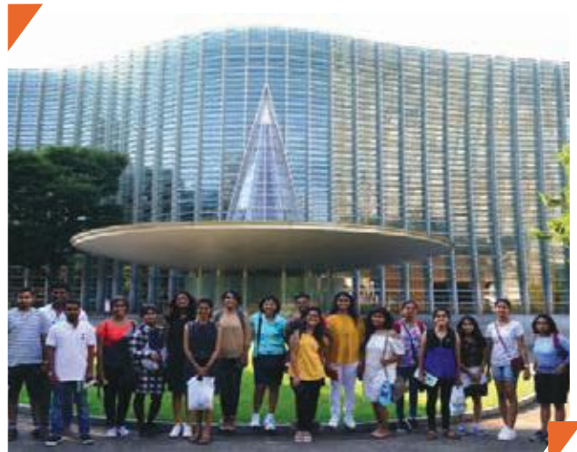
Our students visited Japan to explore works of Tadao Ando and other Japanese masters