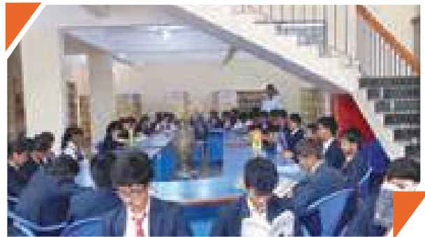
Students at Library