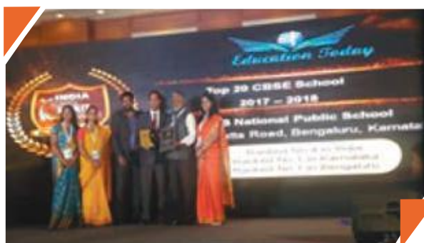
India Top 20 CBSE Schools Ranked No.4 in India, No.1 in Karnataka & Bengaluru