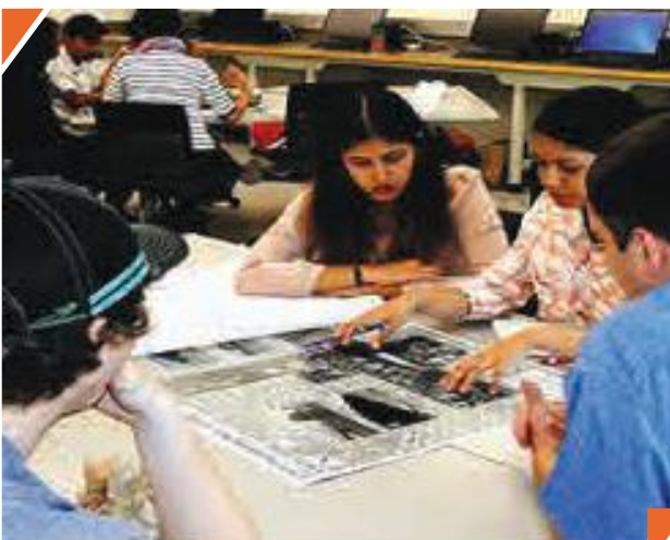
Faculty-led Architectural Tour And Urban Design Workshop – 2017 : USA