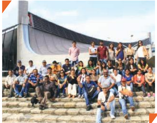
Our students visited Japan to explore Japanese architecture