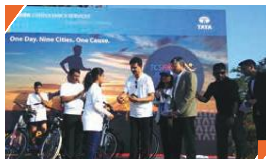
TCS-5K Marathon @ SJBIT