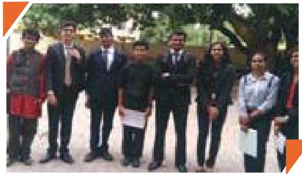
Active MUNNERS of BGSNPS

We aim to create a generation which is modern in its outlook and thinking yet who are firmly anchored in their culture.