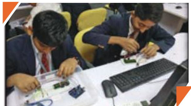
Students working with logistics in CD Lab