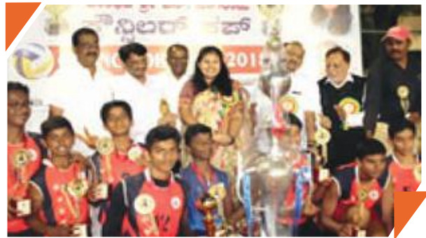
Volleyball - 2018 Qualified to play in the Nationals at Punjab