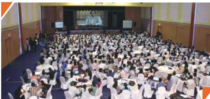
48 Hours Google Hackathon @ SJBIT