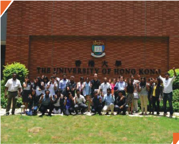
The tour group in The University of Hong Kong