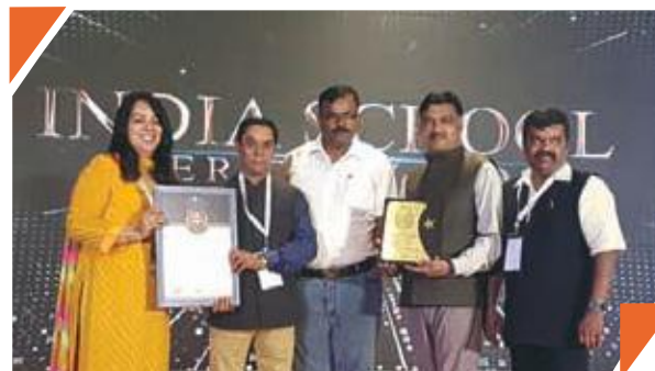
Awarded for 2nd Best Boarding School in Bengaluru and Karnataka and 9th Best among Top 10 Boarding Schools of India as per the survey conducted by EDUCATION TIMES

The curriculum has been designed to cater to the needs of all the students from all over the world to take the Secondary and Senior Secondary School Certificate examination under the Central Board of Secondary Education (CBSE) and Pre University of Karnataka State Board.