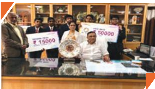
The Winners of MATHWHIZZ National Level Quiz Competition 2017