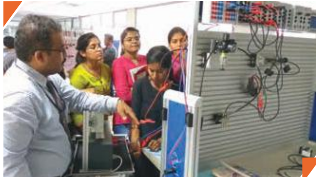
Internship at CETRAT